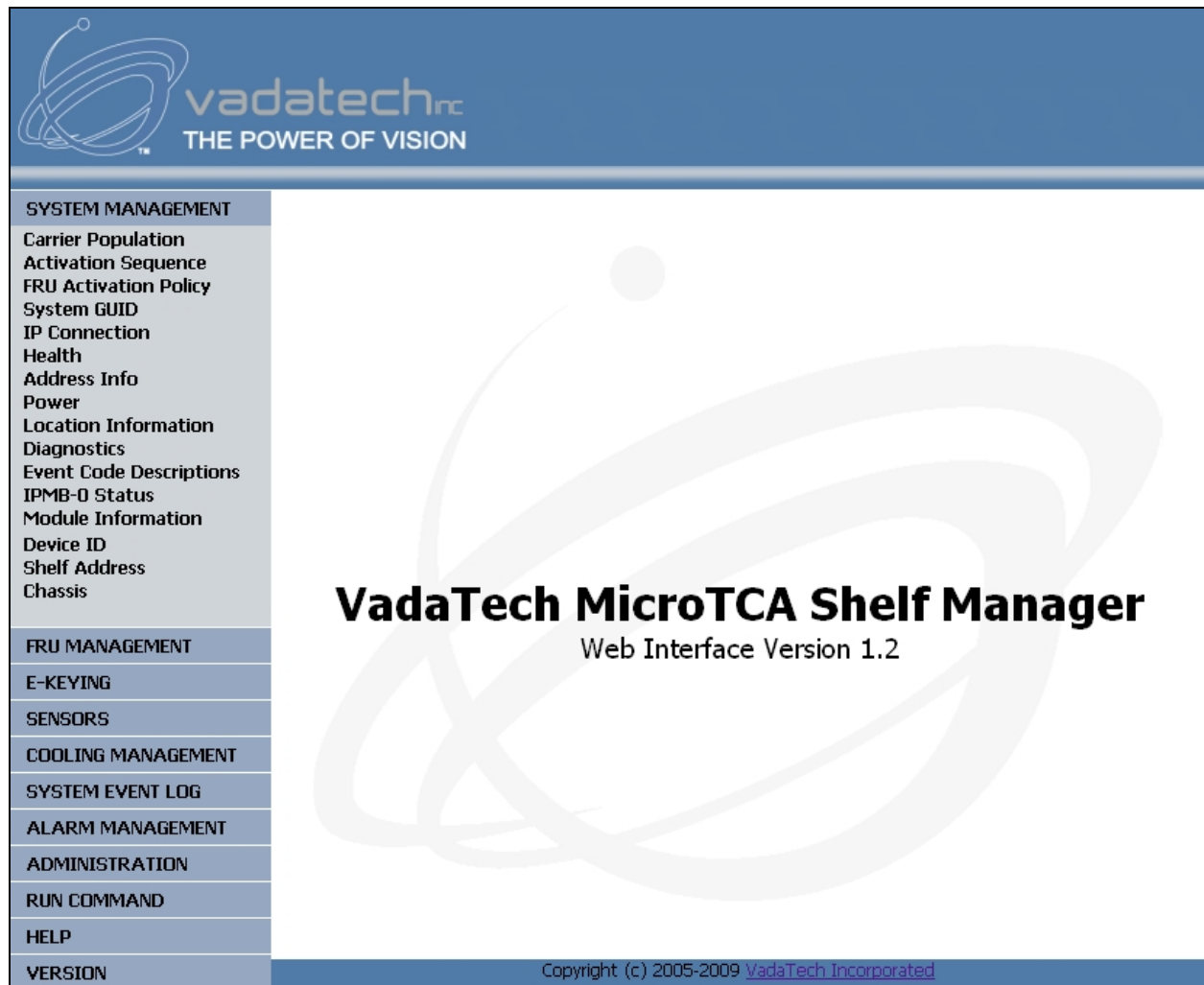
Figure 6: Shelf Manager's Web Interface main screen

Refer to the VadaTech MicroTCA Carrier Manager Web Interface Reference Manual and VadaTech MicroTCA Shelf Manager Web Interface Reference Manual for information about the Web Interface.